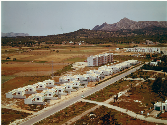
Marina Planas, Puerto de Alcudia , 1966. 10 × 15 cm © Fons Planas, Marina Planas, 2020