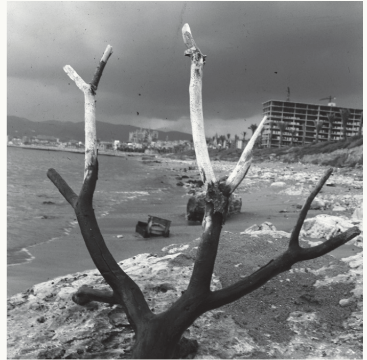
Marina Planas, Playa de Palma , without date. Variable dimensions