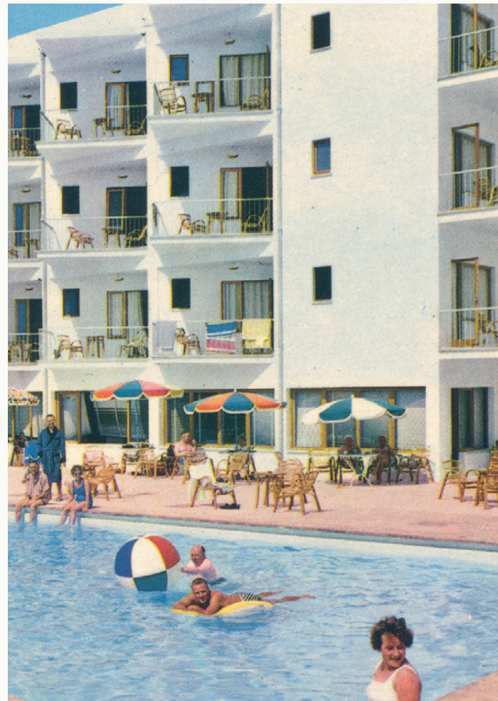
Marina Planas, Bermudas Hotel, Palmanova . 1964. 15 × 22 cm