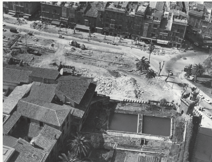
Marina Planas, S'Hort del Rei , without date. Variable dimensions