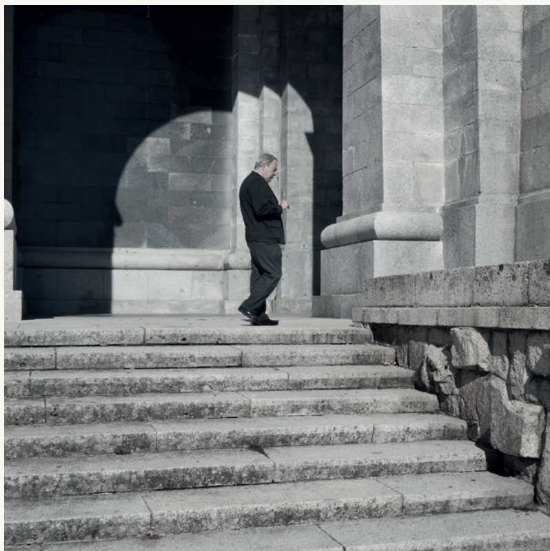
Es Baluard Museu d'Art Contemporani de Palma Collection

A similar idea in a more contemporary format can be found in the tumblr blog Humanitarians of Tinder , 7 which features screenshots of profile photos of white Tinder users surrounded by nonwhite people. This collection of pictures speaks volumes about people's lack of self-awareness as they promote themselves in today's world.