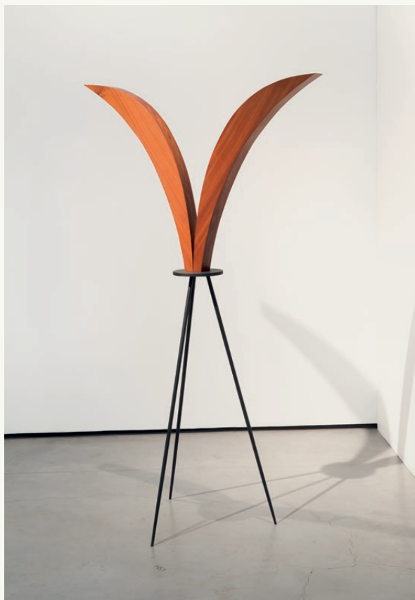
Iman Issa, Heritage Studies #7 , 2015. Wood, painted wood and vinyl text, 198 × 60 × 48 cm. Edition: 1/3 + 2 AP. Es Baluard Museu d'Art Contemporani de Palma, Juan Bonet collection long-term loan