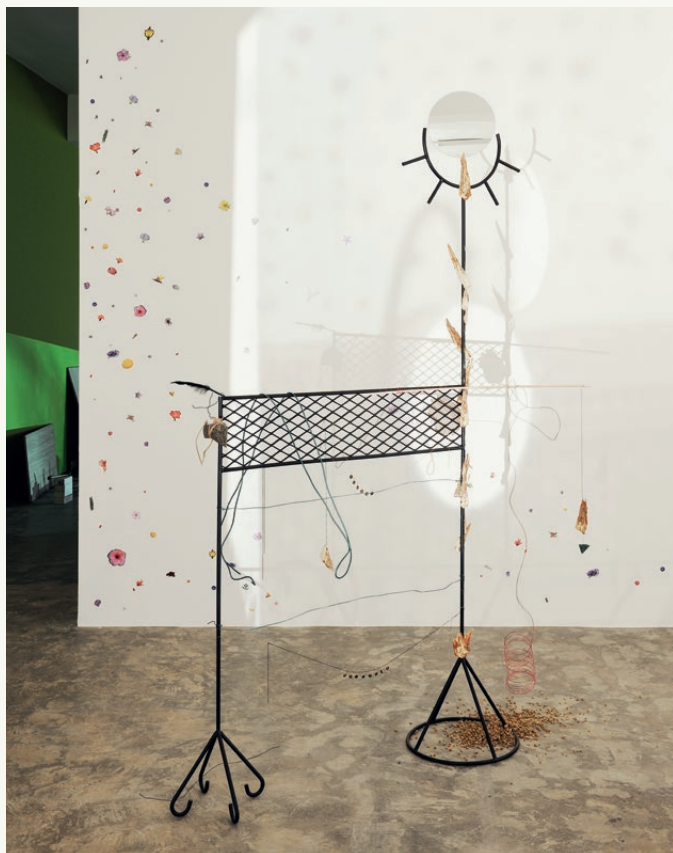
Dineo Seshee Bopape, Renelwe (we are given) . From the installation “Sedibeng, (It comes With the Rain)”, 2016. Painted steel, wire, rope, herbs, charms, feathers, wood, vinyl stickers, mirror, structure, 223 × 128 × 40 cm, mirror 34 × 0,6 cm. Edition: 3 + 2 A.P. Es Baluard Museu d’Art Contemporani de Palma, Juan Bonet collection long-term loan.

Aimless: Confronting Imago Mundi From 3rd February 2023 to 21st January 2024