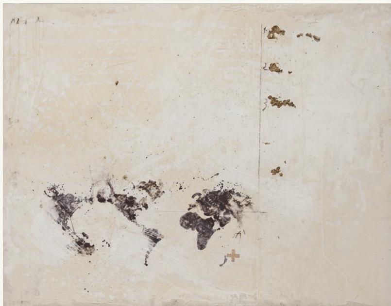
Guillem Nadal, Projecte per a un mapa 33 [Project for a map 33], 1971. Mixed media on canvas, 114x146 cm. Es Baluard Museu d'Art Contemporani de Palma, Fundació Caixa de Balears long-term loan